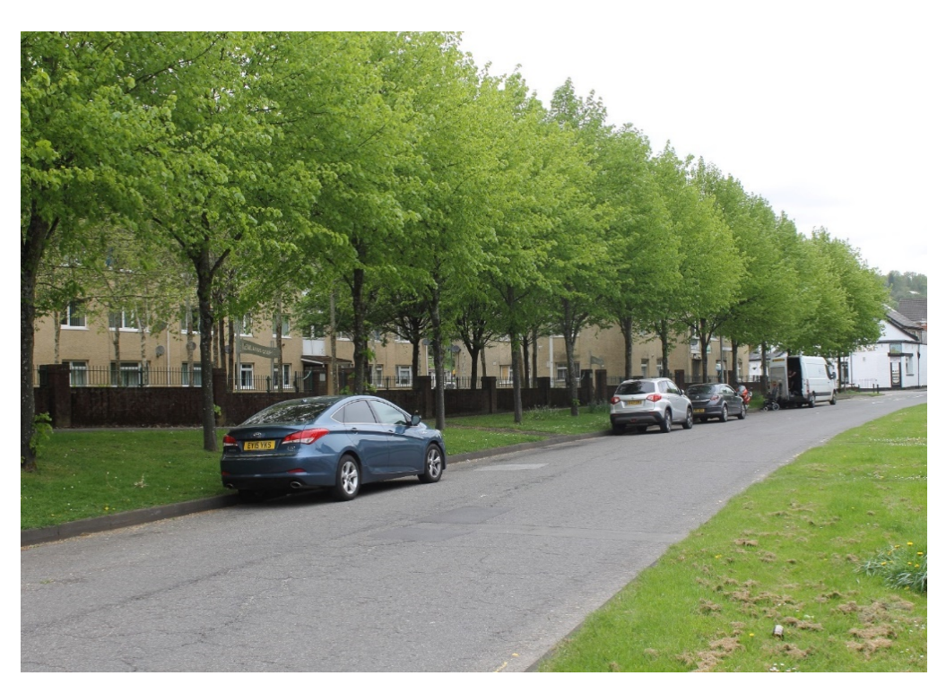
Tree lined street in Pontnewynydd

More information is available via this link: http://www.legislation.gov.uk/ukpga/1980/66/contents