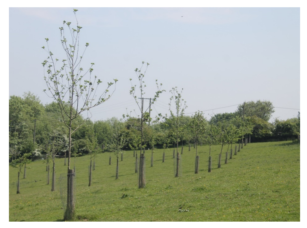
Orchard at Greenmeadow Community Farm