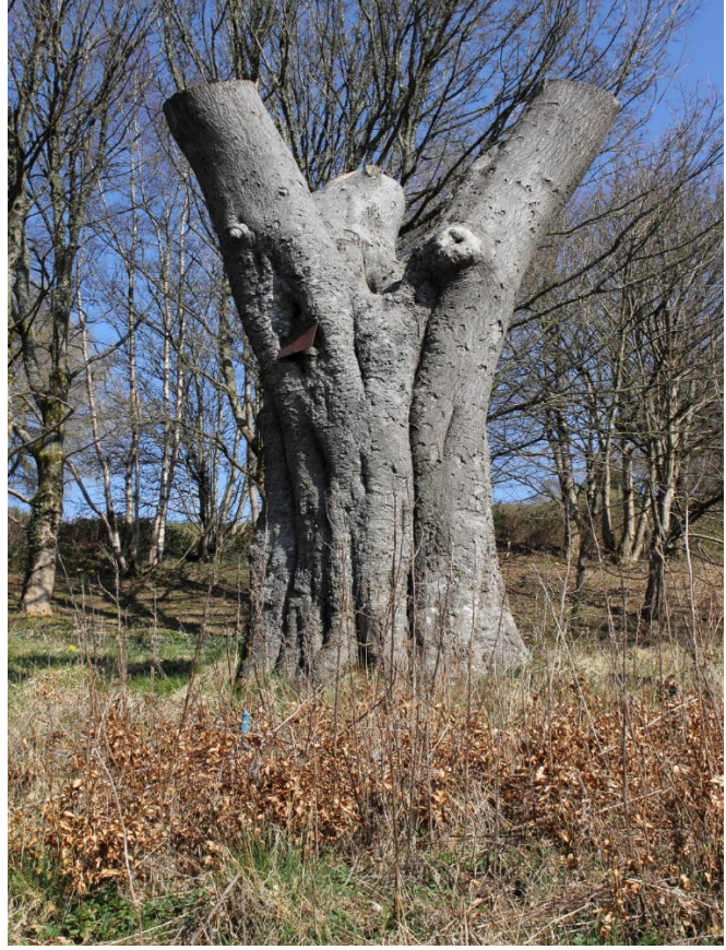
Sustainably managed veteran tree on roadside at Blaenavon