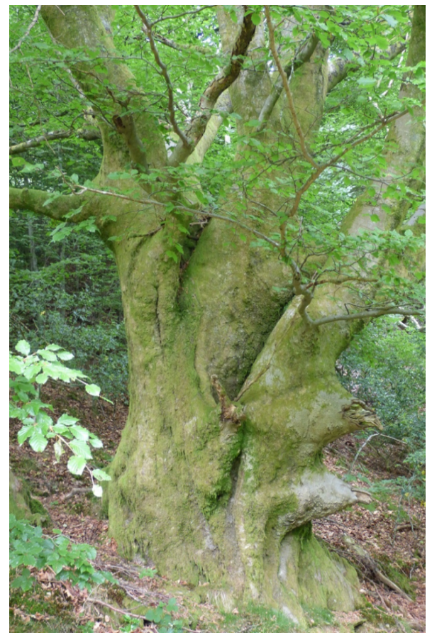
Mature beech tree within Cwm-y-Glyn ancient woodland