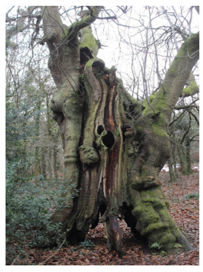
Wales Tree of the Year 2019 in Pontypool Park

'Protect, Plan, Plant and Manage – Growing for our Current and Future Generations'