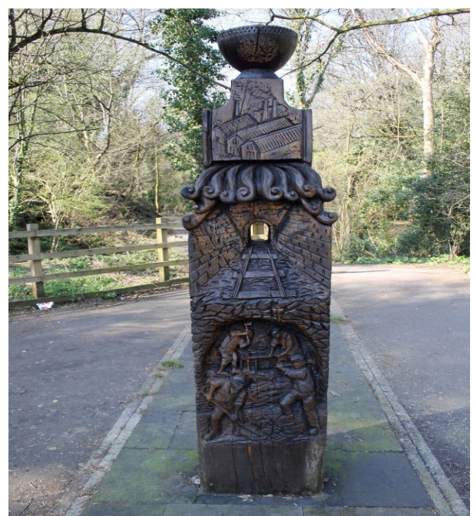
Sculpture in Pontypool Park created from locally sourced timber