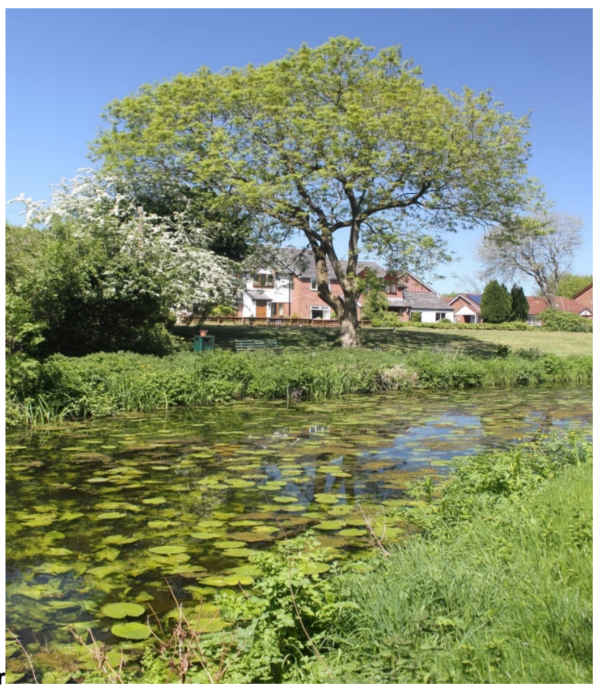
Trees add to the character and ecological functionality of the canal at Ty Coch, Cwmbran.