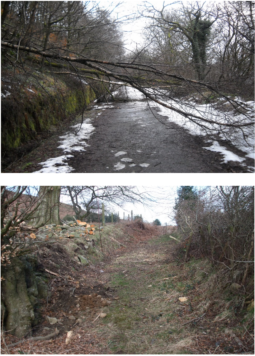
Examples of tree work on Public Rights of Way