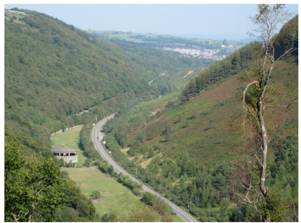
Ancient deciduous woodland and more recent conifer plantation woodland