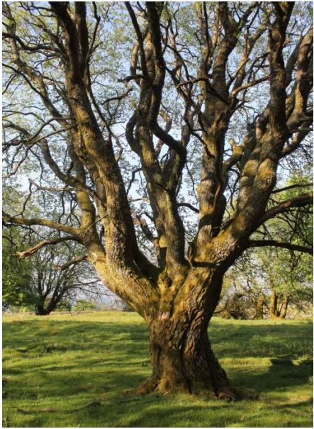
2.19 The State of Natural Resources Report (2016)