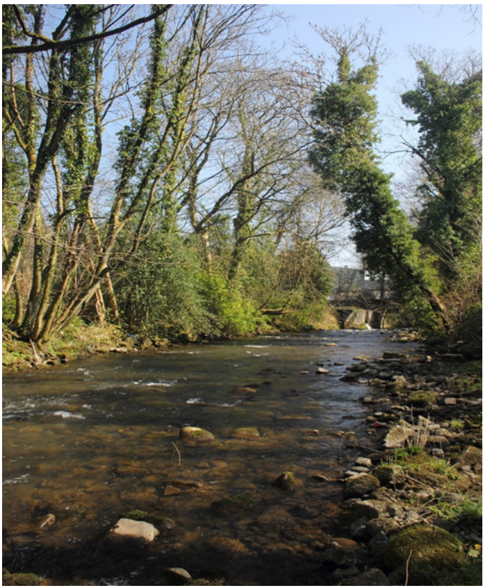
Trees add value to strategic ecological corridors such as the Afon Lwyd

3. To estimate the probability that the tree or branch will fall onto the land-use in question.