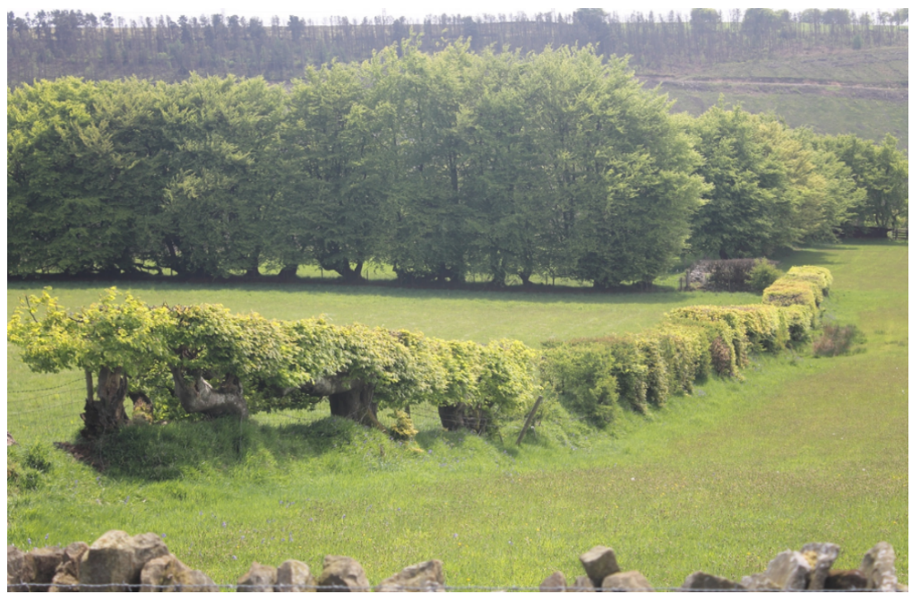
Foreground managed beech hedgerow with unmanaged line of beech trees in background.