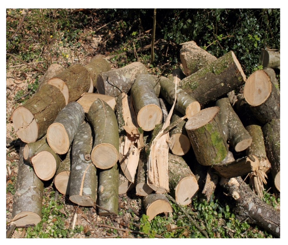
Cut timber can be used as habitat piles or as biomass.