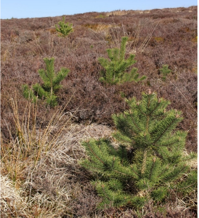
Invasive Lodgepole pine on Mynydd y Garn-fawr part of the Blorenge Site of Special Scientific Interest (SSSI).

3.17.1 The delivery of this strategy and action plan will be monitored and reviewed by Biodiversity and Ecosystem Resilience Plan Officer Delivery Group with progress reported through the three yearly reporting requirements of the Environment (Wales) Act. The Group will seek to ensure the strategy and plan remains updated to reflect any relevant policy or legislative changes.