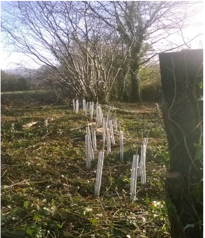
Hedgerow restoration on council owned land