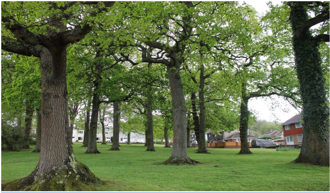
Urban green space Cwmbran showing an even aged treescape with closely mown grass

Further information on TPOs is available via this link: https://beta.gov.wales/technical-advice-note-tan-10-tree-preservation-orders