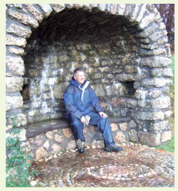
Taking break in the Arbour.

A Trevethin garden was the home of a dilapidated pile of stones that was thought to be on old pigsty. Further investigation showed it was really a garden Arbour its stones were moved and rebuilt at this new location to enable everyone to enjoy its sunny outlook which matches the original in terms of the views over the Severn Estuary.