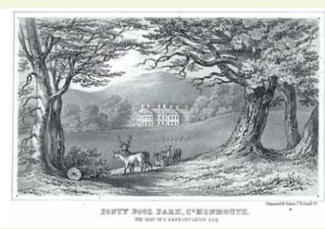
Romantic 1790 view of the Park House and its deer!

The Ice House on your left has the unique feature of looking like a single building but it has two chambers hidden behind its walls with the only access being from the top opening. Originally the ice would have been collected from the park ponds and nearby canal in the winter and stored in the insulated pits to be used to keep food fresh in the summer. This ice could not be used in food as it had all the leaves, twigs and other nasties found floating in the water frozen at its core. It was not until 'fresh' ice blocks could be brought by train from the cities that the family could indulge in fruit ices and luxurious ice cream.