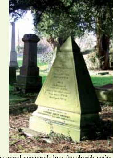
Many grand memorials line the church paths.

Go past the old pub and climb over the stone stile on your left and walk down through the church yard then turn right, going through an older section of the graveyard with some interesting monuments.