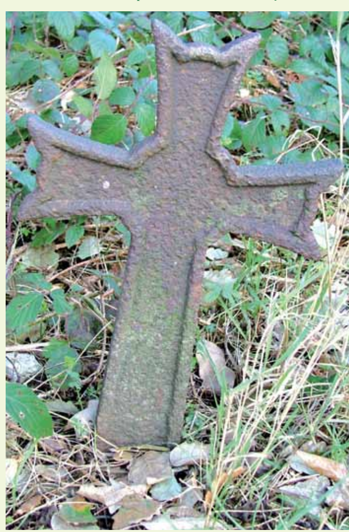
One of the Lllanerch Crosses.

Take time to explore the churchyard and wander its avenues of fascinating memorials. Keep an eye out for the tiny iron crosses that mark graves of some of the victims of a terrible local disaster. In 1890, there was an explosion in Llanerch Colliery and 176