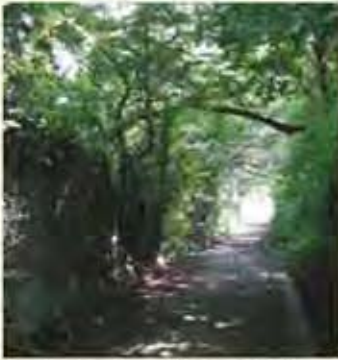
Remains of crossing bridges over the incline