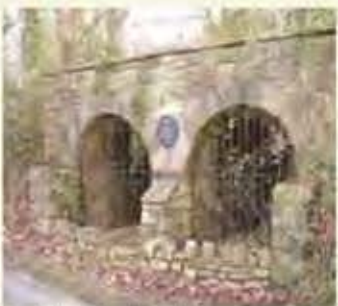
Limekilns at Garth Road

You leave this 2 km section of the Incline at Coed Eva, opposite the old Mill Tavern. Turn left and then turn right at the end of the road, cross over the road at the roundabout, taking the track opposite that leads you past the old Glan y Nant Farmhouse and onto Garth Lane. (Joshua's son Cyrus once lived at Glan y Nant) The incline ended near the Mill Tavern with the materials being transferred to horse drawn trams for the last 1/2 km to the canal.