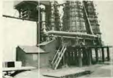
The Oldbury Vitriol works or the "Chem"

Bear left where the original route of Llantarnam Road turns away from the new road to the new town centre; cross over Henllys Way and walk along Victoria Street as it takes you into "Old" Cwmbran.