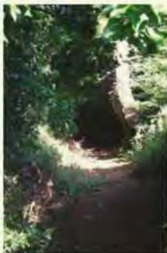
The "Hollow Way"

The footpath that goes up the bank alongside Ty Gwyn Way continues to follow the line of the old St Dial's road as it goes through a tunnel of trees and then bears to the left of Diwedd Lon (Lane End) House; take the sunken lane or "Hollow Way" that goes between the surfaced estate path on your left and the garden wall of Diwedd Lon. This route gives you a true taste of the ancient tracks that once passed through the area.