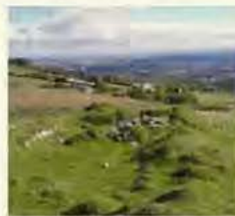
Site of St Derfel's Chapel

The chapel, a grange house attached to Llantarnam Abbey, once held a relic of St Derfel, a Celtic prince that fought alongside King Arthur at the battle of Camlan.