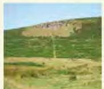
Looking back at Henllys Quarry

This part of the path is the first section or "top drop" of the steam driven incline railway that took the stone from Joshua Hanson's Henllys quarry in drams to be used along the line