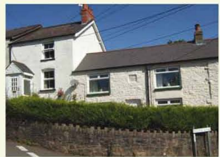
Belle Vue Terrace, Henllys

Continue down the hill on the line of the incline as it passes between the spoil heaps, bearing right at the bottom; go over the stile and continue down the track to some stone steps at the bottom. As you come out onto a tarmaced lane the cottages on your left are some of the earliest cottages built by Joshua, called "Old Row" and "New Row". Bear right down the lane, passed "Four Houses", bear left around Belle Vue Terrace then bear right, and continue down Incline Lane as it passes "Machine Cottage".