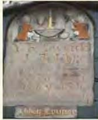
Plaque at The Greenhouse Public House

It shows two tail-coated, clay pipe smoking gentlemen sat at a fine gate legged table. The translated text reads "The Greenhouse 1719. Good beer and cider for you. Come inside and you shall have some"