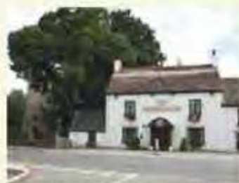
St Michaels and The Greenhouse

Bear left then turn right onto Ty Coch Way; at the end of the road turn left and walk along Hollybush Way. Take care crossing by the roundabout as this is a very busy road. Continue straight ahead through Llantarnam Park Industrial Estate. Keep an eye out for another old white farmhouse on your right that has been incorporated into a modern office building. This was Ty Coch House and there is a myth that a tunnel ran from here to Llantarnam Abbey. At the end of Llantarnam Park Way, turn left by the Abbeyfields roundabout, walking up the hill until you are opposite The Greenhouse Public House.