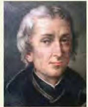
Saint David Lewis

In 1678, Father David Lewis was found hiding at the smithy after he had visited his recusant cousins at the Abbey, most probably to celebrate mass. He was arrested for the treasonable act of being trained and ordained abroad as a Jesuit priest and of preaching the catholic faith. This gentle man, known as "Tad y Tlodion" (Father of the Poor) was tried and executed outside Usk Gaol in 1679. Local feeling was so strong the official executioner fled in fear of his life and the scaffold had to be built by a fellow prisoner with the promise of freedom. He too fled and a local blacksmith was bribed to do the hanging, drawing and quartering. David Lewis was made a saint in 1970.