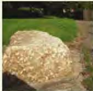
Puddingstone marker at Thornhill

Cwmbran. It is believed that they were once used as route markers because the stone is bright with white quartz pebbles. This quartz was formed on the coast of Africa over 325million years ago, before the European land mass began its drift northwards. On the banks of the route are also the strangely shaped trunks of ancient beech hedges.