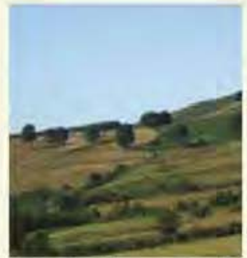
Route over Mynydd Maen passed St Derfel's

7 As you draw level with second and largest stone quarry on the right, look for a stile and a steep green path going down the hill on your left.