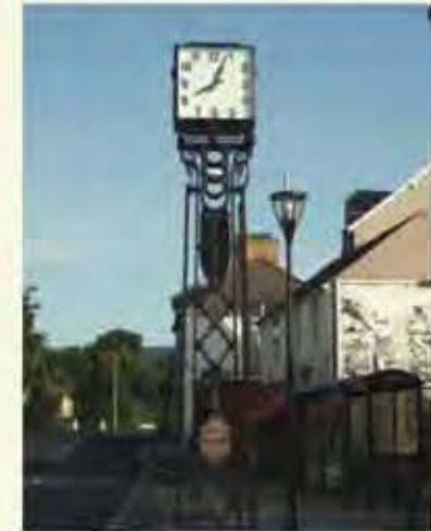
Town Clock, Old Cwmbran

After you pass the fine clock and the council offices in the "town" centre, turn left along Commercial Street. The bridge that now takes you over Cwmbran Drive once passed over the GWR Eastern Valleys Railway and the Canal.