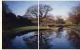
The boating lake

If you are starting at the Llanyrafon Manor 1 or the adjacent Boating Lake 2 Car Parks, walk towards the lake, crossing the footbridge over the Afon Llwyd. Skirt right, around the pond and head for the footbridge over the railway line. Once over the bridge, follow the path as it takes you up onto the Llantarnam Road. Cross the road and turn right.