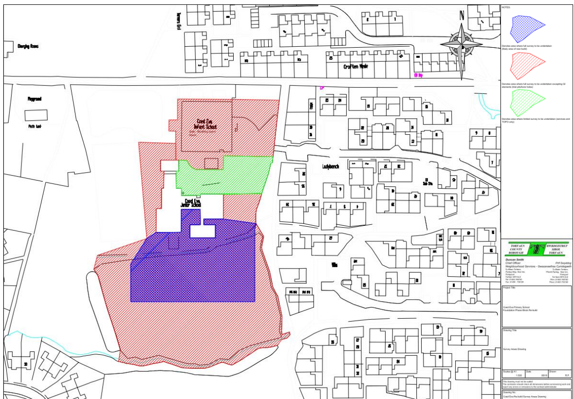
Figure 3: Site Location Plan

The proposed site location is shown in Figure 3 .