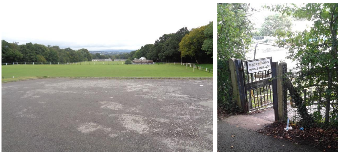
Figure 2: Playing Fields Car Park (Left) and Infants School Pedestrian Access (Right)

During a site visit undertaken on 20.09.2016 it was noted that the vehicular pick-up arrangements were predominantly taken from the parking area located off Ffordd Penylan, with 25 vehicles occupying the car park at approximately 15:20. The parking area off Ffordd Penylan is shown in Figure 2 . Pick-ups also took place from a layby located on the western side of Henllys Way, immediately north of its junction with Teynes Road and on-road at Teynes Road.