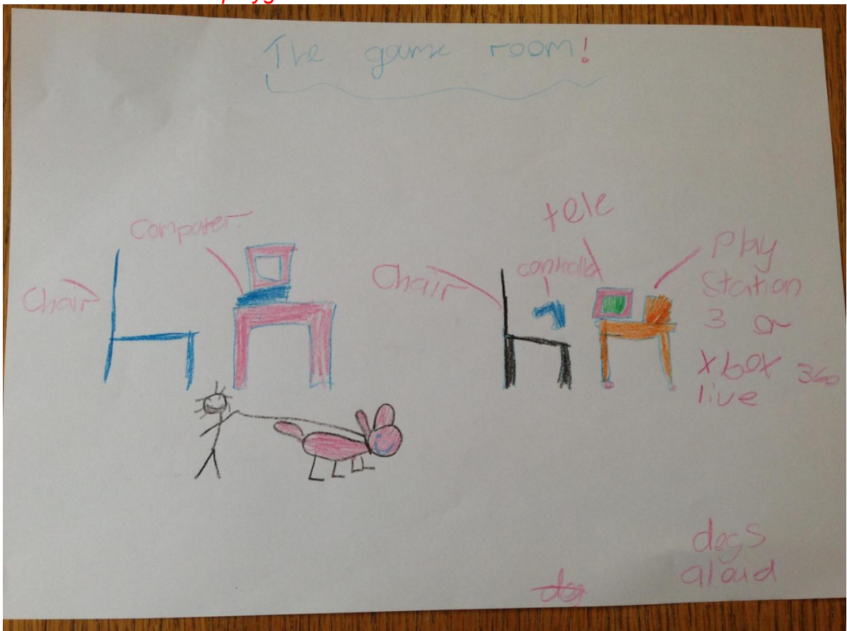
"I would love to have a games room for lunch times at Blenheim Road"