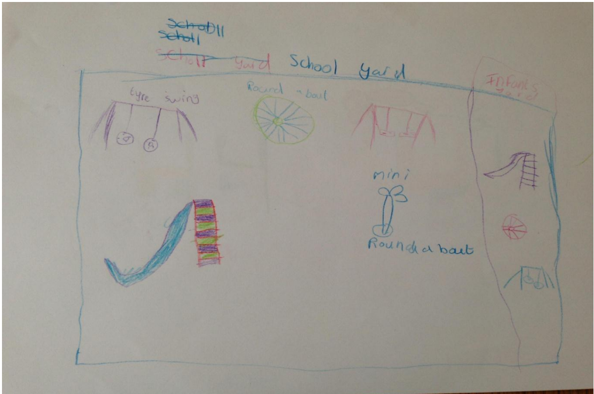
"I would love the new playground to look like this"